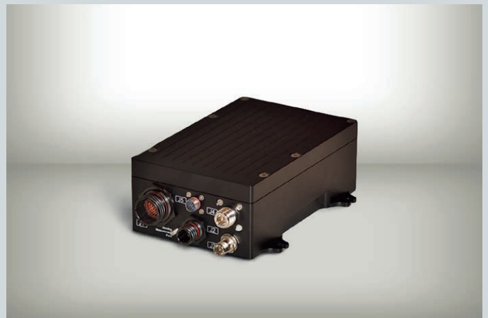
AIS - Automatic Identification System